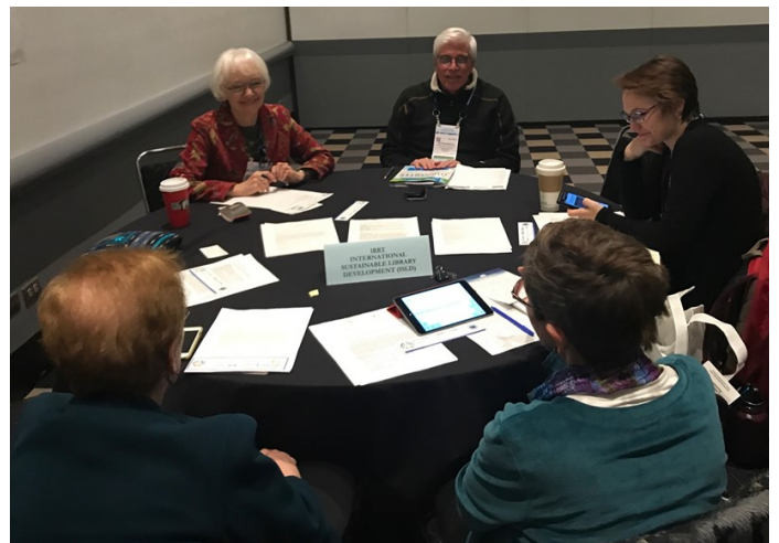
International Relations Roundtable (IRRT) Sustainable Library Development Subcommittee meeting.