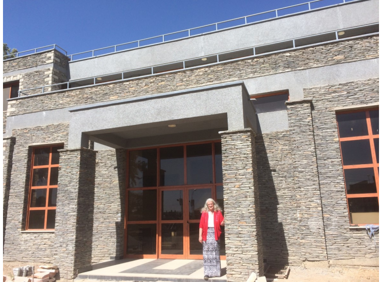
At the entrance of the Axumite Heritage Foundation Library.

Will my objectives be met by June? Time is fleeting and a certain sense of panic is setting in. Even so, I know much can be accomplished at a distance if need be and I have more excuses to return to a place that has become my home and a people who have become my family.