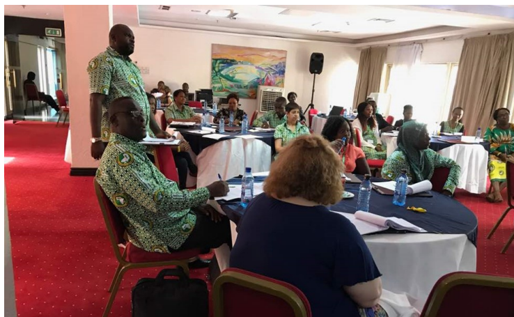
Participants learn leadership skills at the AfLAC training.

Participants are working in different areas including agriculture, health information, bibliotherapy, environmental issues, access to information online, economic empowerment, and improving the reading culture in their different communities.