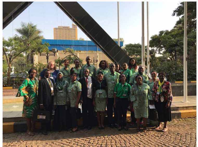
AfLAc participants, coaches, and facilitators at Laico Regency Hotel, Nairobi Kenya

The assignment of developing and implementing a project in the community is positively stretching the skills and knowledge of all the participants. As required by the academy all participants are expected to develop a project of their choice to address their community needs through libraries. Thus far, this activity is achieving great results as participants are meeting with and listening to various members and stakeholders in their different communities. These projects are in progress and participants are eager to present them at the African Public Libraries Summit in July 2018 in Durban, South Africa. Clearly, every participant is working hard to ensure that their project is worth reporting at the summit.