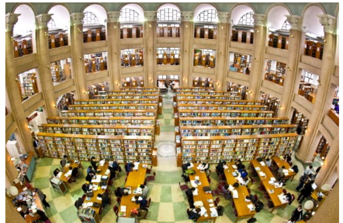
Kyung Hee University Library, South Korea