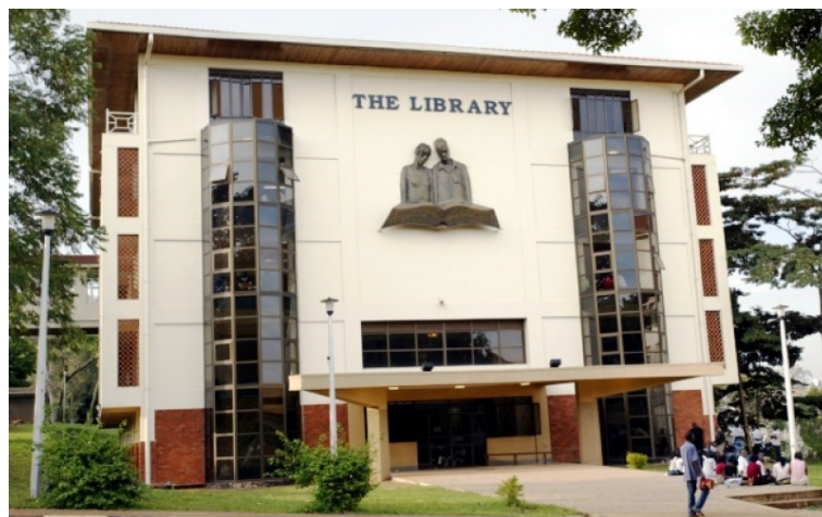
Makerere University Library, Uganda