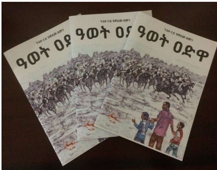
The Tigrinya version of "Back in Time to the Battle of Adwa: African Victory 1896"