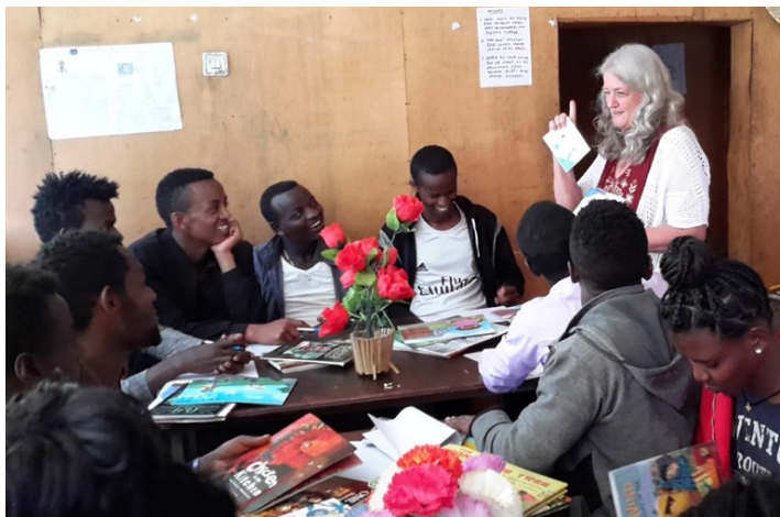
Discussing children's literature during an African Storybook workshop at the Ras Abebe Aregay Library in Debre Birhan

Delays are a matter of fact in Ethiopia. A promised opening of the Axumite Heritage Foundation Library