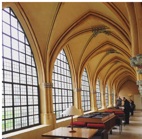
Saint-Corneille library, Compiègne, France

Two years ago, we had a session about failing in libraries: when does a librarian fail? When do we know we failed? Do we really learn by failing? Dealing with these issues at IFLA conferences makes the answers way more interesting than if we had done it in our single countries.