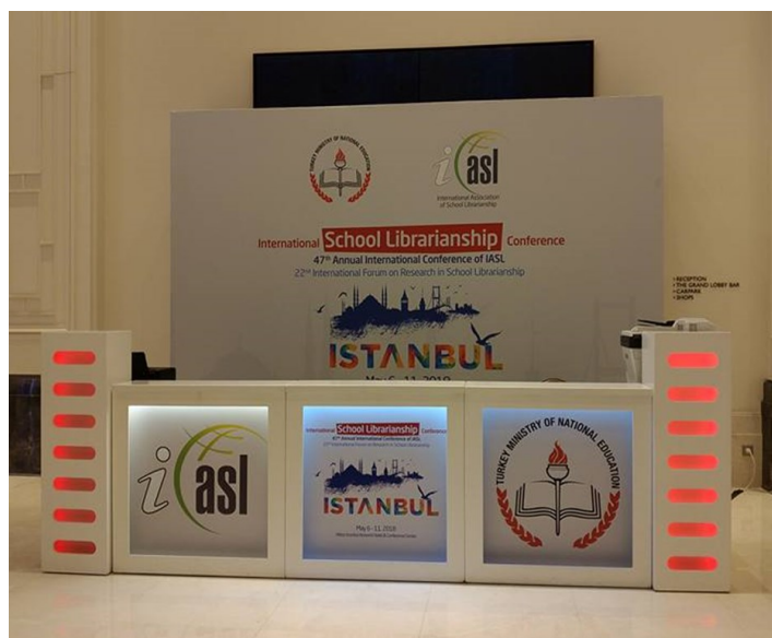
Conference registration desk

the hosting country's school library of choice. Seeing the diverse languages and cultures represented is humbling, and it is fascinating to leaf through the pages.